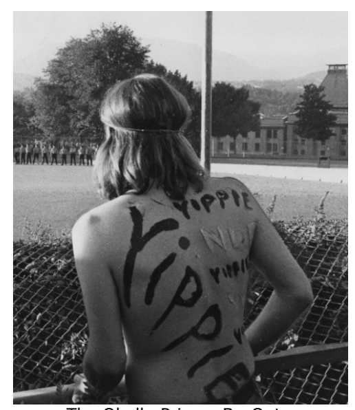
The Okalla Prison Be-Out

Experience from China, India, Persia, Egypt, Rome, Aztlan, Peru, among others, indicate the barbarians from the north always fulfill their historical duty to clean up the rotten decadent civilizations people create and become dependent upon. The Blaine invasion will stand as an early important skirmish in that historical process.