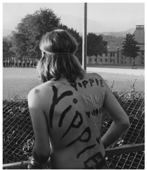
The Okalla Prison Be-Out

Experience from China, India, Persia, Egypt, Rome, Aztlan, Peru, among others, indicate the barbarians from the north always fulfill their historical duty to clean up the rotten decadent civilizations people create and become dependent upon. The Blaine invasion will stand as an early important skirmish in that historical process.